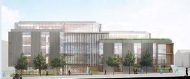
New building – View from 3 rd Street