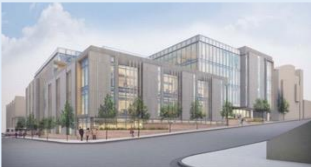
New building – View from corner of 18 th Street & Tennessee Street